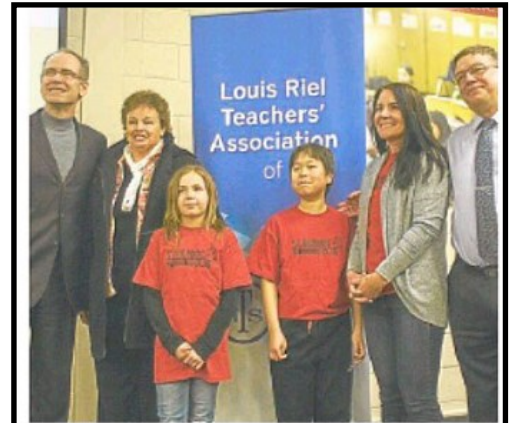
Members of St. George School's running club will see the benefits of Louis Riel School Division's new program, Fuel Up! Feed Our Schools.

Much thanks goes out to all Council Representatives for promotion of the grant, to each school that applied/received including: Louis Riel Arts and Technology Centre, Minnetonka School, Windsor Park Collegiate, Victor Wyatt School, Glenlawn Collegiate, St. George School and Dakota Collegiate as well as to The Metro for highlighting the work of LRTA teachers in the public domain.