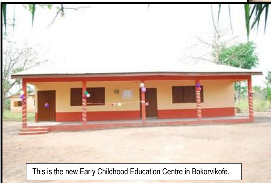
This is the new Early Childhood Education Centre in Bokorvikofe.