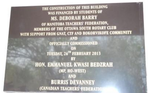
This is the plaque that has been placed on the building.