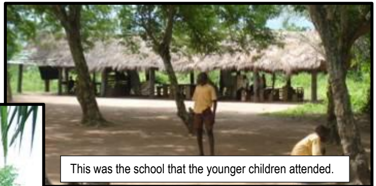
This was the school that the younger children attended.

Congratulations and thank you to all the people and Organizations who were involved in making this dream a reality!