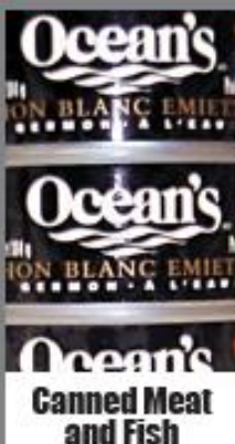
Canned Meat and Fish