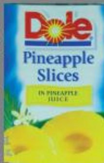
Canned Fruit & Vegetables