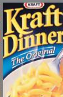
Macaroni and Cheese